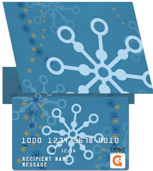
Buy Matching Gift Card