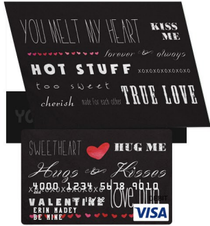
Buy Matching Gift Card