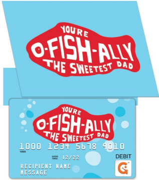
Buy Matching Gift Card